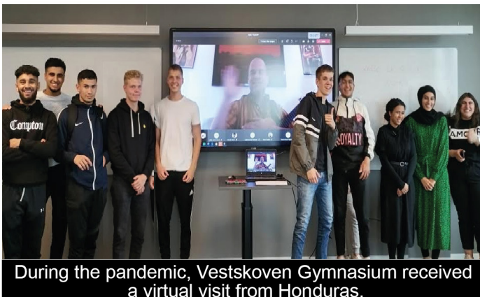
During the pandemic, Vestskoven Gymnasium received a virtual visit from Honduras.

CIPREVI is now processing the evaluation report as well as internally evaluating the outcome. Nunca Más is awaiting their response as well as the response of the Lenca organisation (MILPAH). Part of the outcome of the project is a video and a unique publication that gives an overview over the ancestral health practices of Lencas. These documents will be shared on the website of Nunca Más. A video on the project activities was produced.