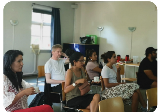
6 out of the more than 30 who participated in our last General Assembly